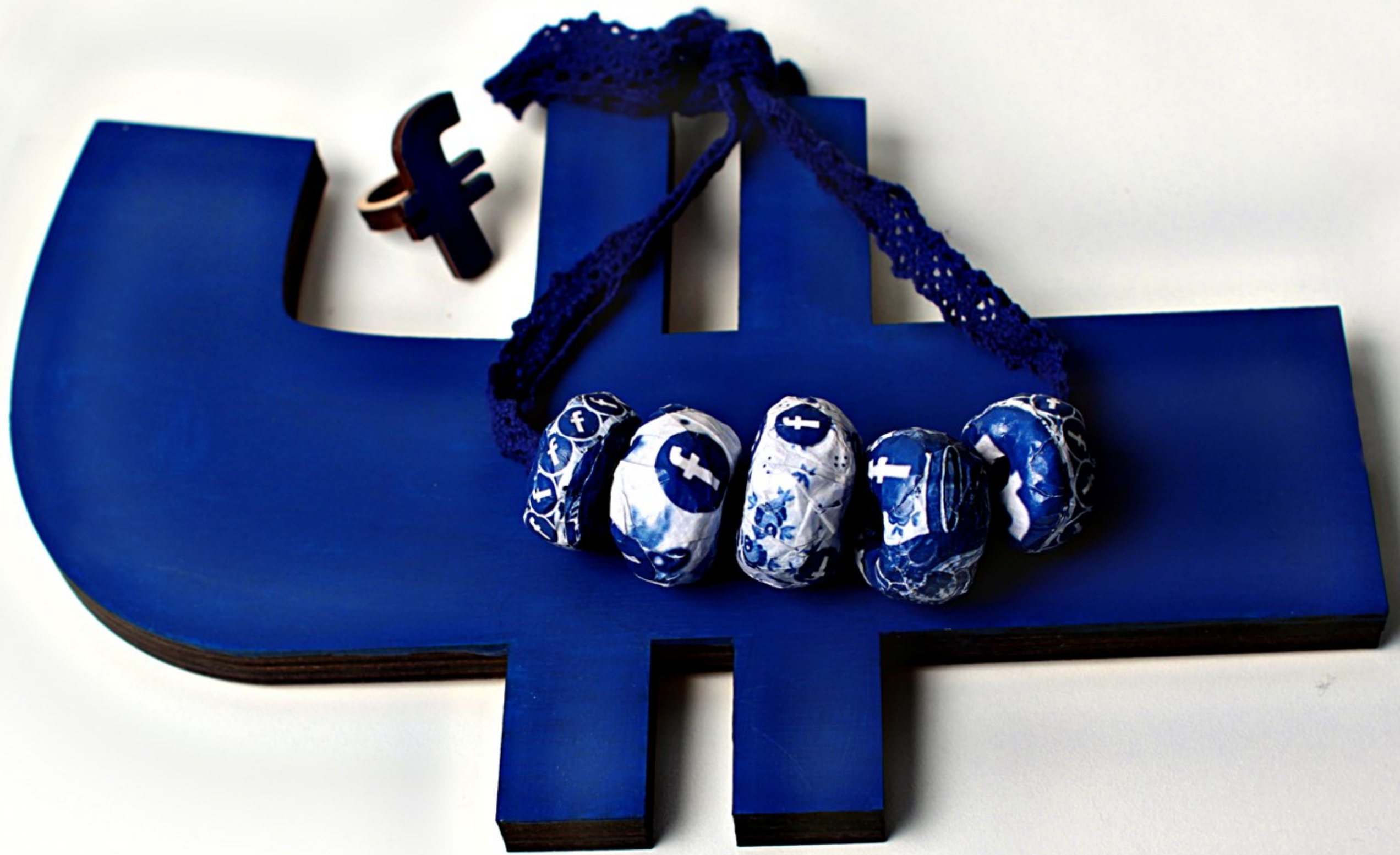
"Facebook" jewellery collection