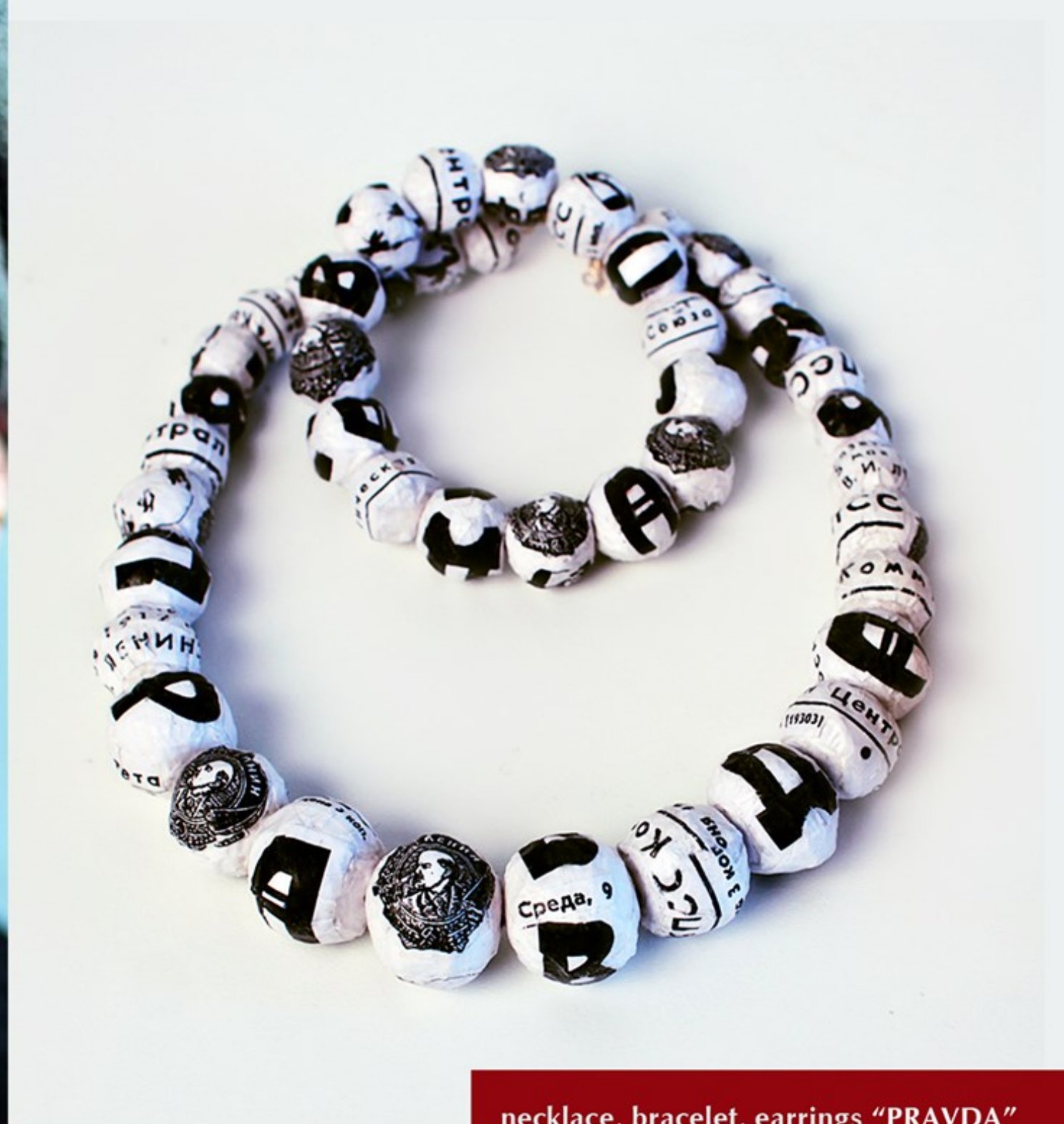
necklace, bracelet, earrings "PRAVDA"