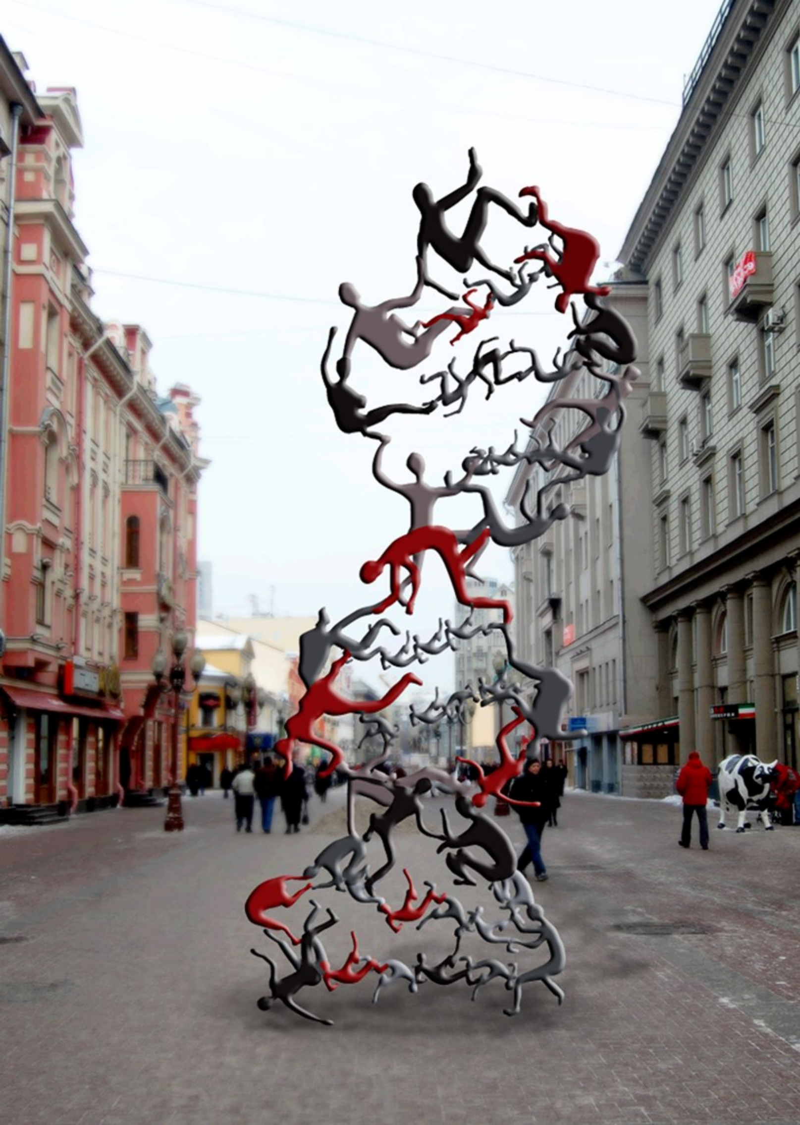
«Humanity» installation / 2015