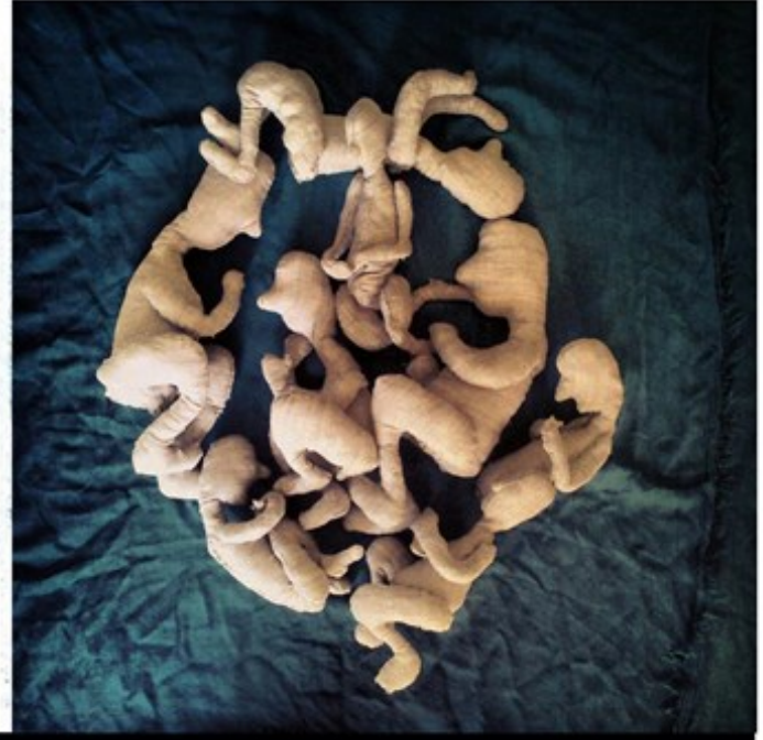
Sculpture elements / polimer clay / casting