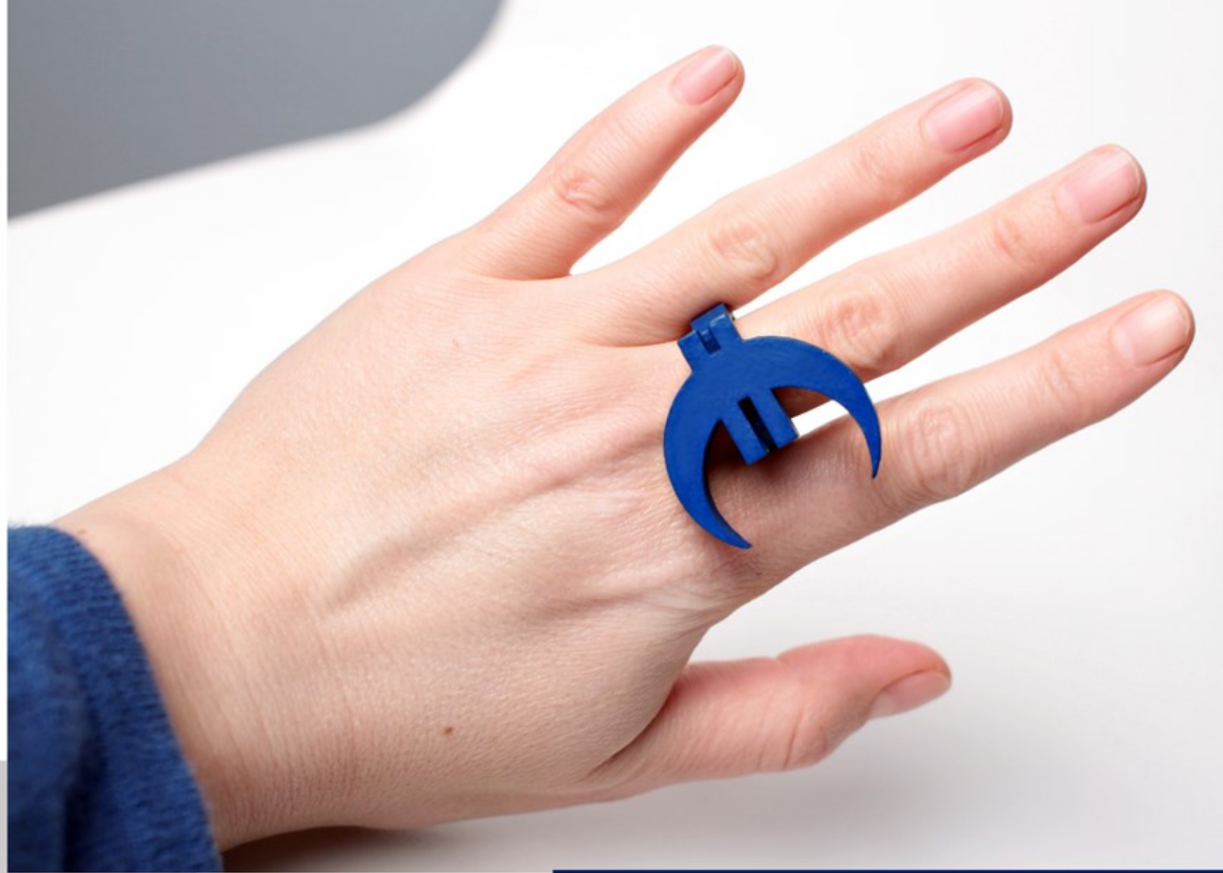
Contemporary European Ring