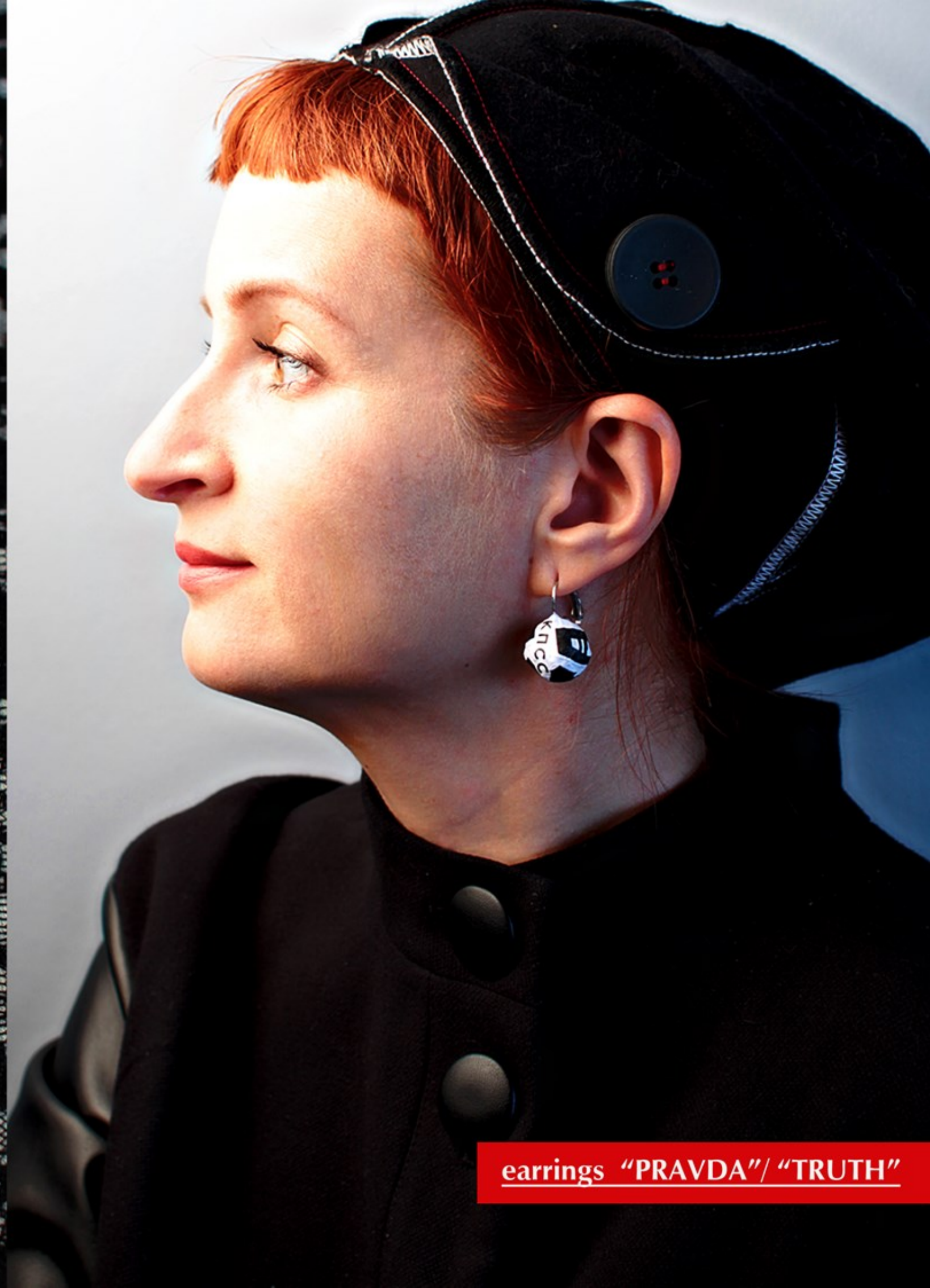
earrings "PRAVDA"/ "TRUTH"