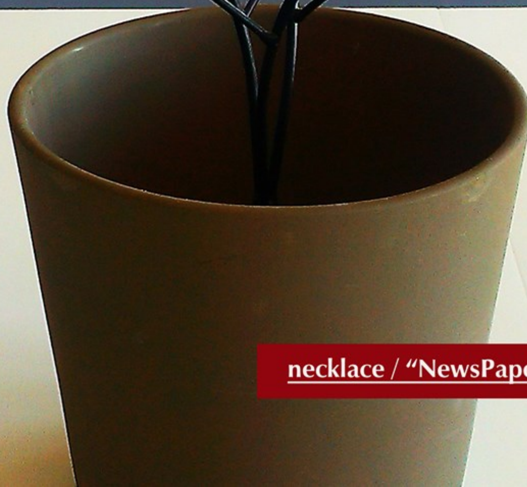
necklace / "NewsPaperWork"